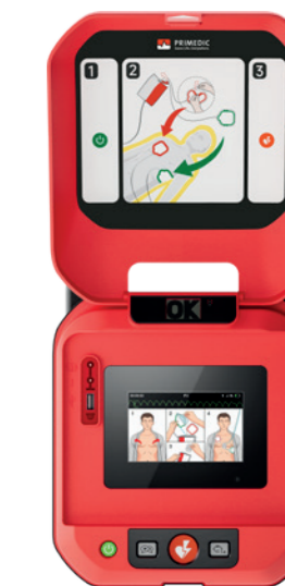
Semi-automatic operation, 4.3" LCD color display