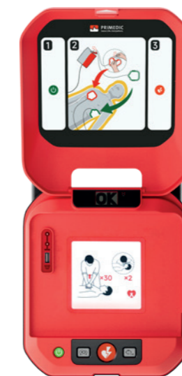
Semi-automatic operation, without display