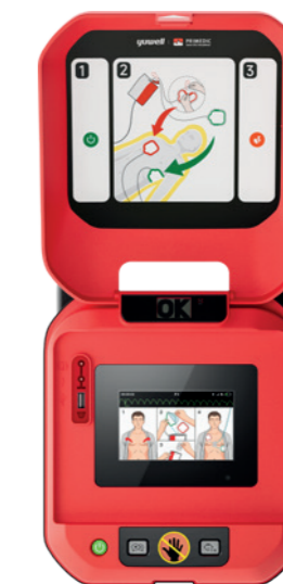
Fully automatic operation, 4.3" LCD color display